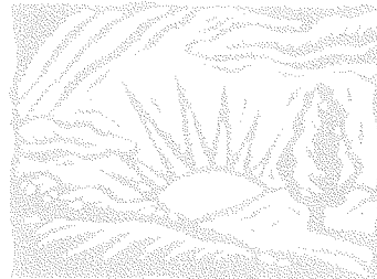
Behold! I make all things new!

An entertaining yet powerful mime helps us understand how Eucharist is a sacrament of hospitality and HOPE which has the power to transform our lives and the lives of our families.