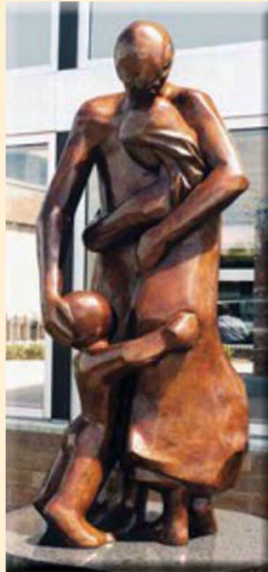
Actual sculpture may vary from image above.

We are still accepting orders for memorial stones until March 1. Contact Theresa at 419-8836 or tke147@gmail.com or Patty Whelchel at 436-9200, ext. 30, or patty@holyfamily.com. You are welcome to work out a payment plan as we hope to provide enough flexibility to anyone who wishes to participate in the garden. All stones will be moved to the new parish site in the future.